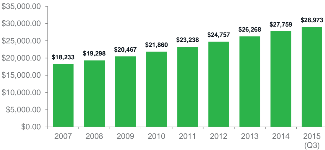
FIGURE 1: AVERAGE BALANCE PER BORROWER (FEDERAL STUDENT LOANS) 7

Unlike other types of consumer debt, which have realized reduced levels of delinquency and default compared to highs reached following the Great Recession, the student loan market continues to show signs of distress. 8 The Bureau estimates that a quarter of student loan borrowers are, collectively, either delinquent or in default on more than $175 billion in student debt. 9 Borrowers with certain characteristics, including borrowers who attend proprietary schools and borrowers who do not successfully complete a program of study, comprise an