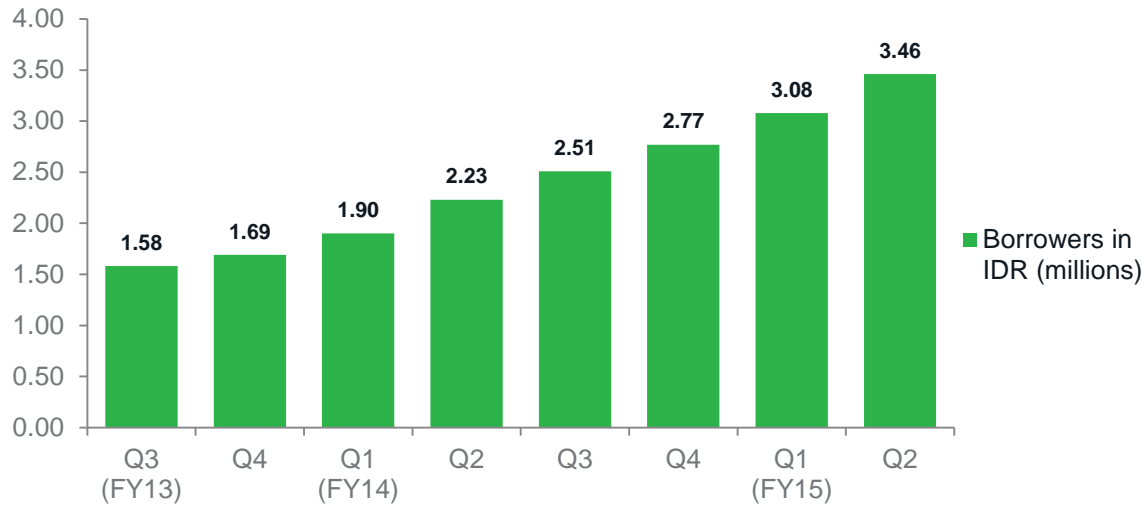
FIGURE 3: INCOME-DRIVEN REPAYMENT PLAN UTILIZATION OVER TIME (DIRECT LOANS) 52

The following discussion highlights specific servicing practices related to enrolling in alternative repayment plans, as identified in public comments and other input received by the Bureau.